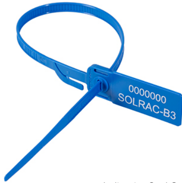
Indicative Seal Certified in conformity with ISO 17712:2013